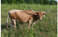
RR Chocolate Whisper