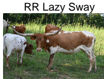
RR Lazy Sway